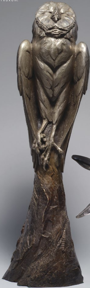
Nearly Dawn, bronze, ed. of 35, 31 x 8 x 8 in.