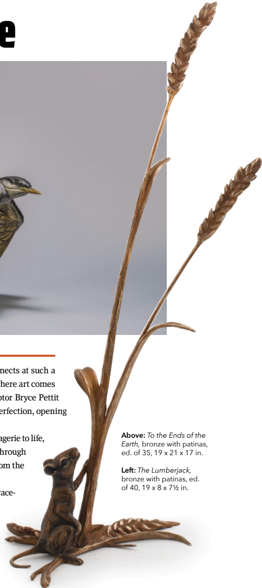
Above: To the Ends of the Earth , bronze with patinas, ed. of 35, 19 x 21 x 17 in.